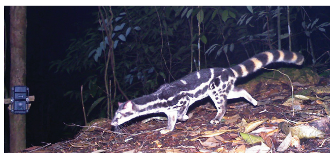
Fig. 1. Banded linsang Prionodon linsang camera-trapped in Crocker Range Park, Sabah, Malaysia, on 26 December 2011.

trapped: several species of ground-dwelling South-east Asian weasel Mustela Linnaeus, are camera-trapped only rarely, even where known by other methods to be present (Duckworth et al., 2006; Abramov et al., 2008; Ross et al., 2013; Chutipong et al., 2014). Many behavioural and microhabitat characters can affect the chance of a species being camera-trapped, in addition to its abundance. Perhaps the author with the most direct knowledge of banded linsang in the wild, Lim (1973), considered it frequently to inhabit secondary and edge tangles. These are not typical camera-trapping areas. Nothing is known about its home-range sizes or population densities.