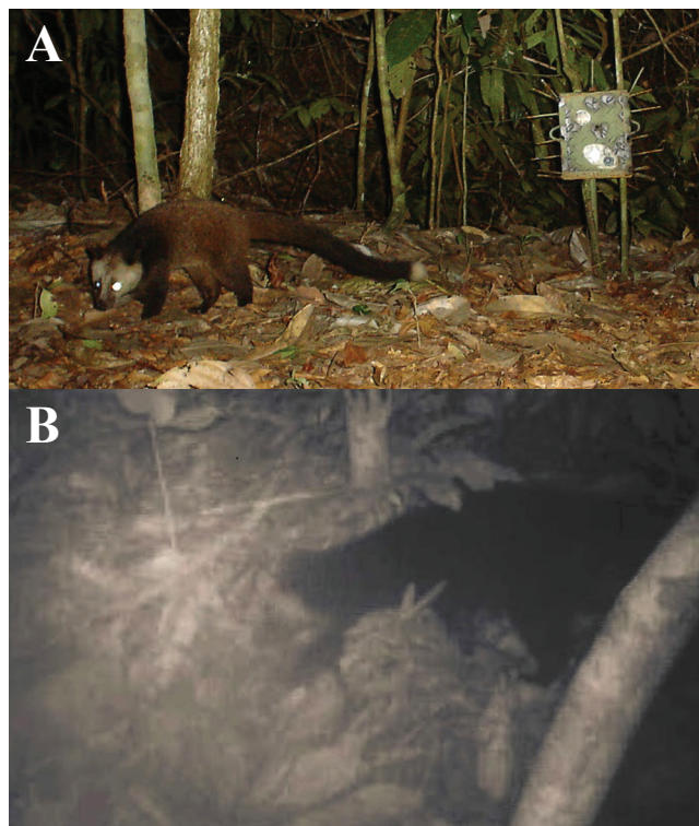
Fig. 1. A, masked palm civet Paguma larvata camera-trapped in Danum Valley Conservation Area, Sabah, Malaysia, on 6 February 2008. B, masked palm civet Paguma larvata camera-trapped in the Schwaner mountains, in PT. Sari Bumi Kusuma concession area, N 0°51'30" E 112°08'59", 217 m asl, on 16 May 2012.