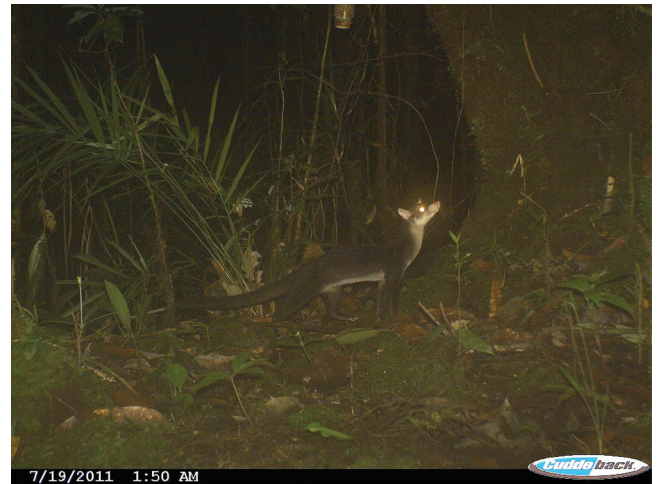
Fig. 1. Hose's civet Diplogale hosei camera-trapped in the Protected Zone of the Sela'an Linau Forest Management Unit, Upper Baram, northern Sarawak, Malaysia on 19 July 2012.

On Malaysian Borneo, Hose's civet is listed on the Schedules of Totally Protected and Protected Species as 'Protected' under the Sarawak Wild Life Protection Ordinance (1998) and the Sabah Wildlife Conservation Enactment (1997), implying limited protection and lenient punishment to offenders. It is not listed as a protected animal in Brunei