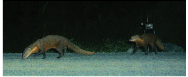
Fig. 1. Collared mongoose Herpestes semitorquatus camera-trapped in Deramakot Forest Reserve, Sabah, Malaysia on 12 August 2008.