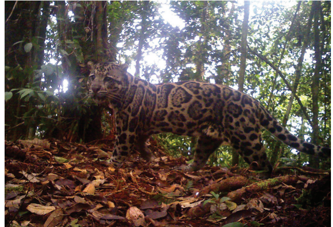
Fig. 1. A male Sunda clouded leopard Neofelis diardi photographed at around 1300 m a.s.l. in the Crocker Range Park, Sabah, Malaysia, on 23 October 2011.

The spatial ecology of this wild cat is largely unknown. A female in Sabah occupied a home-range of 16.1 km 2 and a core-range of 5.4 km 2 (95% and 50% fixed-kernel estimators, respectively) over a 109-day period (Hearn et al., 2013). Annual ranges, and those of males, are likely to be significantly larger.