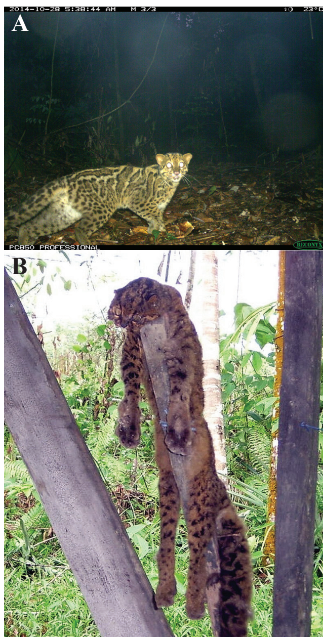
Fig. 1. A, marbled cat Pardofelis marmorata camera-trapped in Deramakot Forest Reserve, Sabah Malaysia on 28 October 2014; B, marbled cat hunted in eastern Sarawak for its meat and pelt.

Historical and recent records indicate that marbled cat is a rare species, and therefore little is known about population