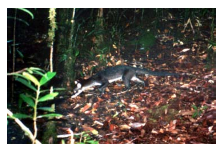
Fig. 3. Hose's Civet Diplogale hosei Sela'an-Linau Forest Management Unit, upper Baram, Sarawak.

The Sela'an-Linau FMU may be the only place where camera-trapping found this little-known species regularly, let alone